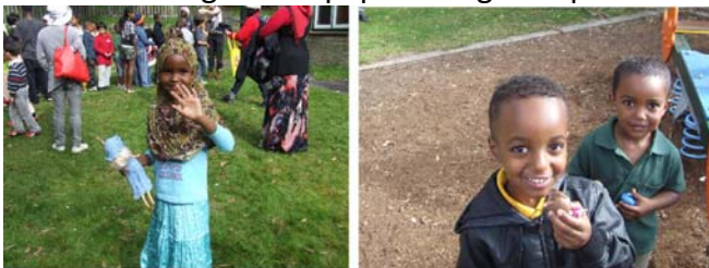
Easter Egg Hunt Debrief Mission accomplished!

Children who chose not to take part in the games were able to enjoy the makeshift art and craft hub and paint pictures and make 'butterfly' creations using folded paper and glitter paint