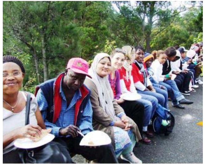
Lunch in the bush surrounds

Lunch was a huge barbeque including vegetarian trimmings.